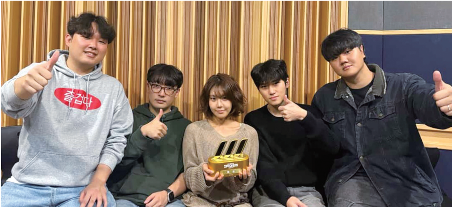
The Cadenza members