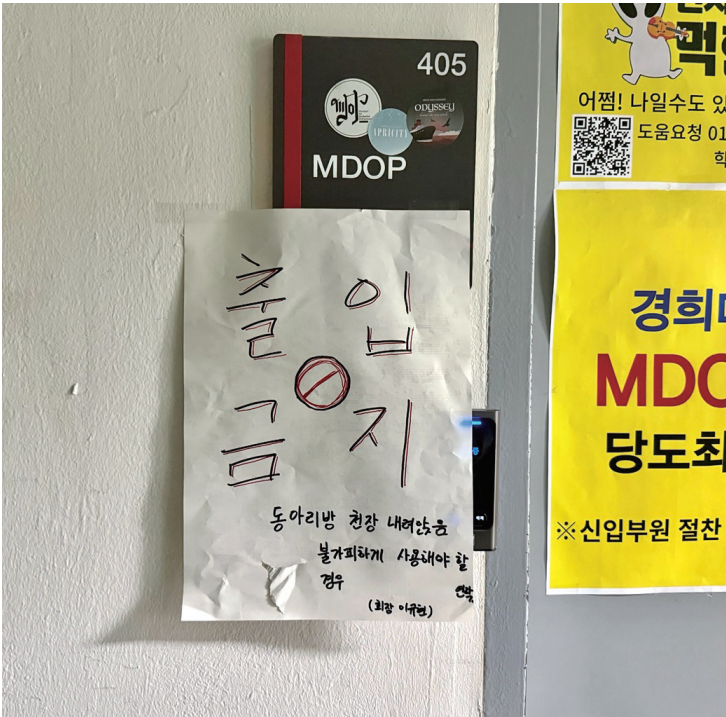
Club room closed due to ceiling collapse

The transformation of the Students Center is expected to enhance the quality of student life and boost participation in club activities.