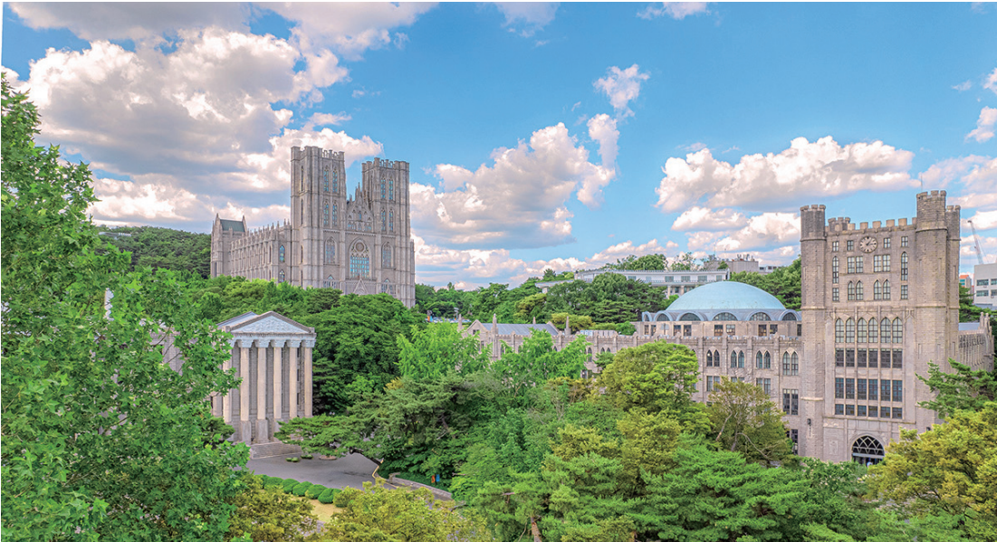
Kyung Hee University

The launch of the Special Woojung Scholarship is seen as a first step toward using these additional funds to enhance student welfare and invest in broader campus improvements.