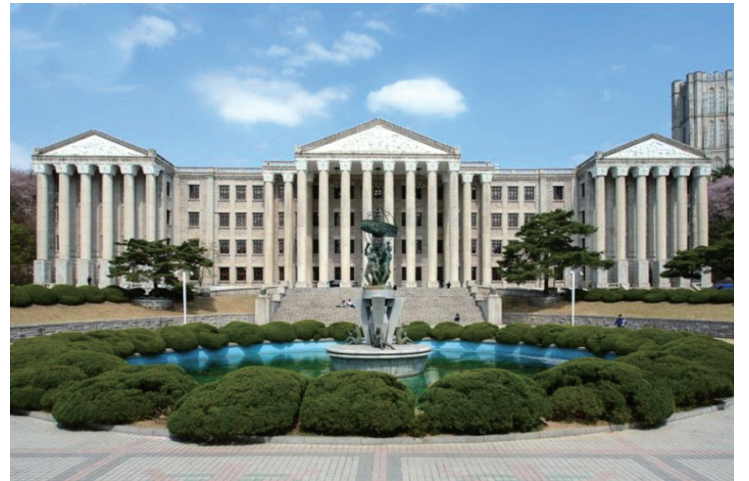
KHU Administration Building