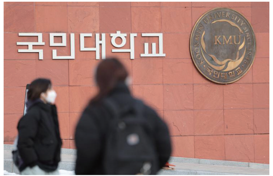
Entrance of Kookmin University